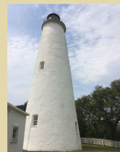
Ocracoke Lighthouse History