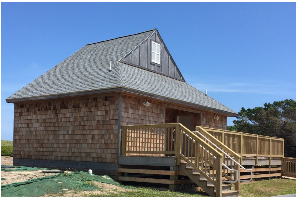
The new restroom facility at the Ocracoke Beach Access opened last weekend.