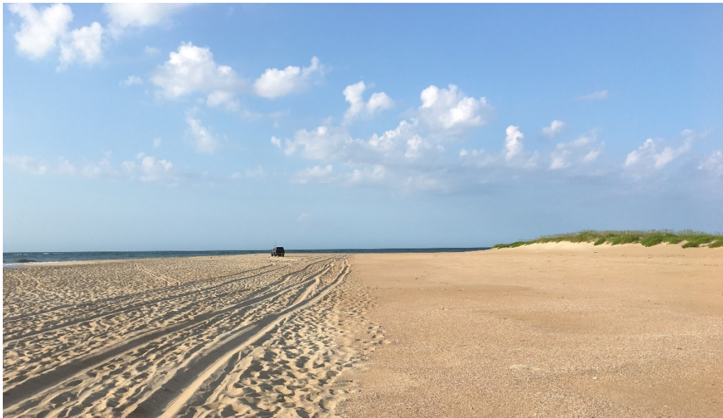
Off-road vehicle access to Cape Point resumed yesterday morning.