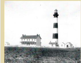
Bodie Island Lighthouse history